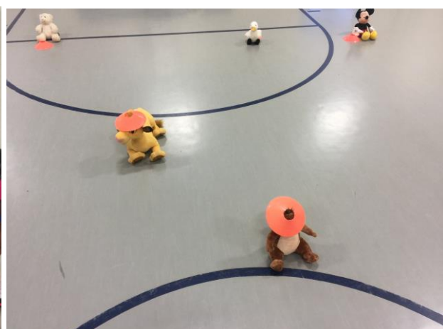
Figure 4: Captured Pokémon