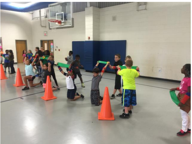
Figure 3: Aiming for a Pokémon