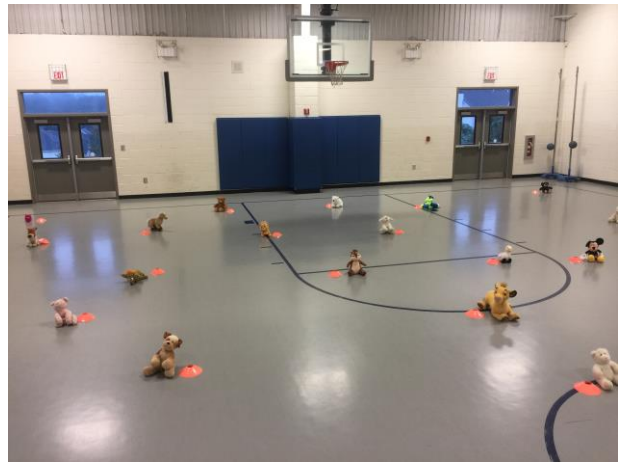
Figure 1: Pokémon animals spread out